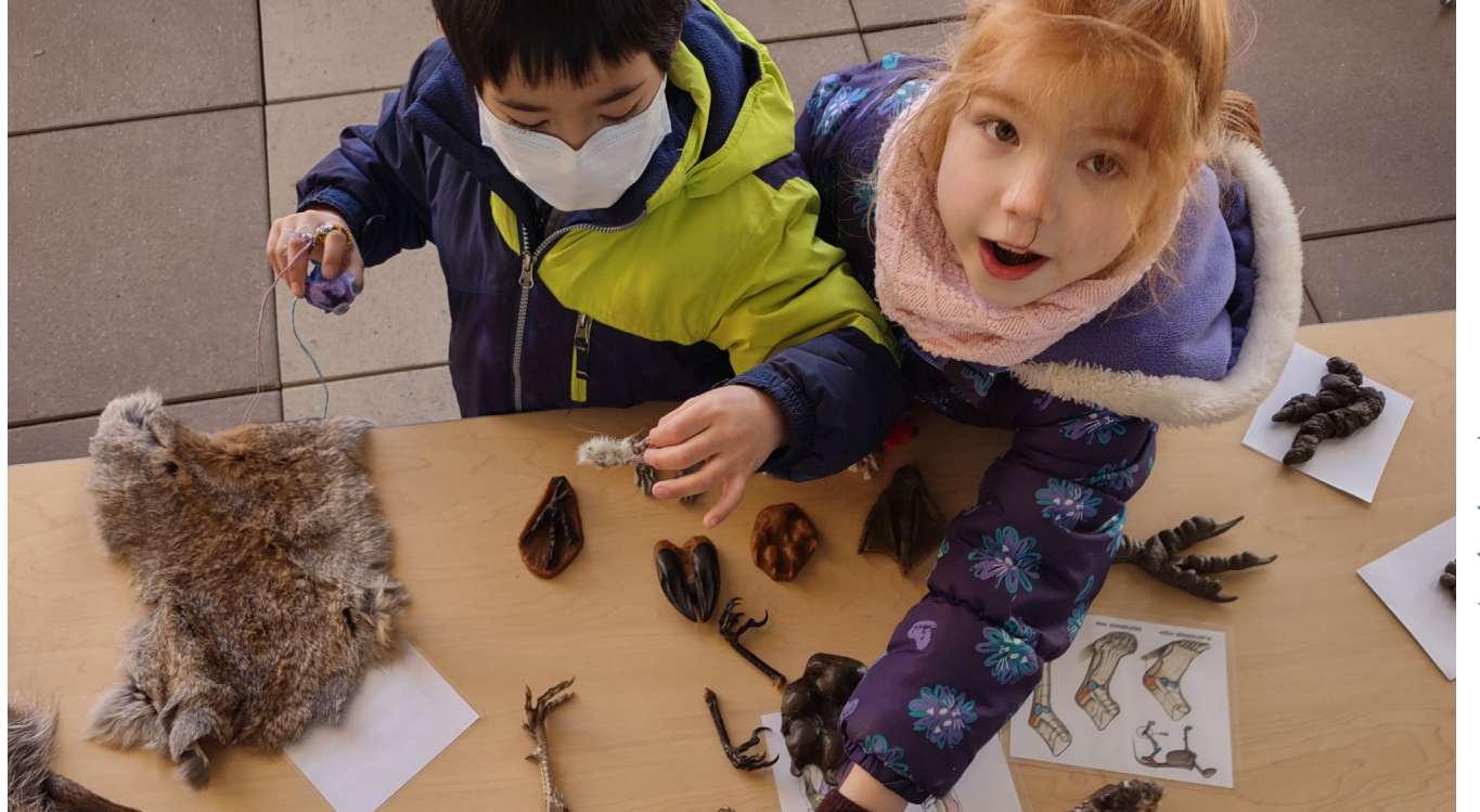
Curious kids