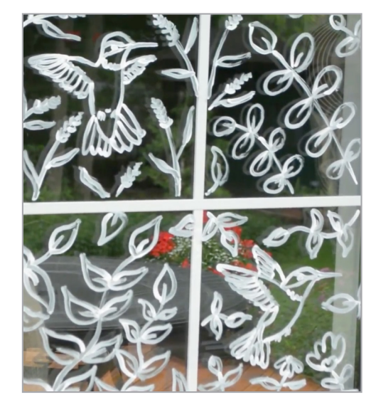
Collision-preventing art | FLAP Canada

Black-capped Chickadee | Brenna Marsicek