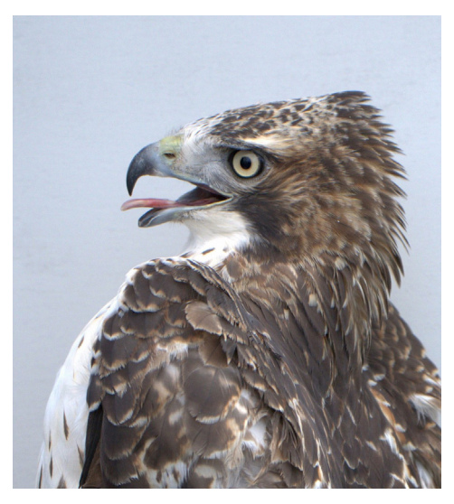
Madison the Red-tailed Hawk

Madison, the Red-tailed Hawk Banded October 31, 2021