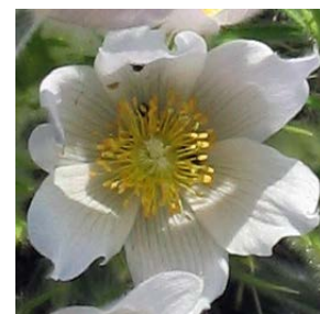
Pasqueflower (here and above): a favorite of early spring