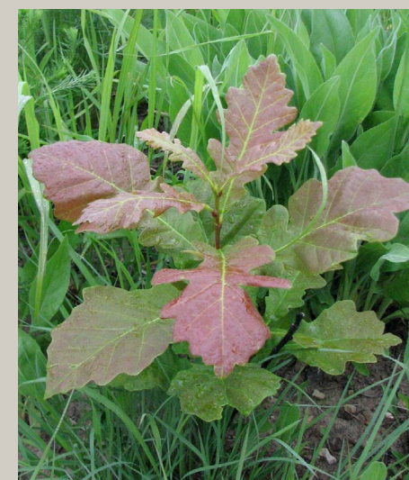
One for the ages: a seedling bur oak in a Faville Grove prairie/savanna restoration